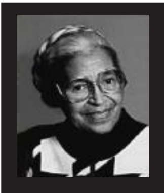
Rosa Parks Civil Rights Activist 1913-2005

Critical Mass is bicycling's defiant monthly celebration of the cyclist's right to the road. We honor Ms. Parks' legacy with a tour of important locations in Chicago black history.